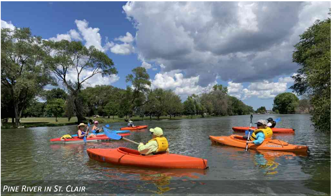
PINE RIVER IN ST. CLAIR

Except for a few drains that flow into Lake Huron or Lake St. Clair, the St. Clair River is the receptor of all drainage basins within St. Clair County and water level fluctuations of two to three feet are common. This fluctuation, along with rapid currents, causes tree mortality, shoreline erosion, and major alterations to the